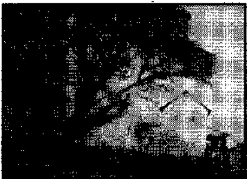
View of original location of Baum home with the Kitty Hawk Oak, circa 1930. From the Bald View B&B Collection.

By Emerson Brantley, American Forests' Tree Nursery